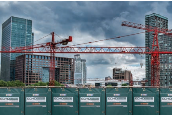
World-leading noise control.