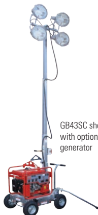
GB43SC shown with optional generator