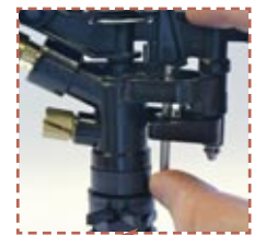
Easy part-circle adjustment

Long range nozzles (long vane) + short range nozzle