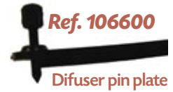
Difuser pin plate