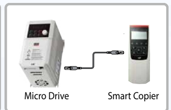
Smart Copier (Parameter copy without power)