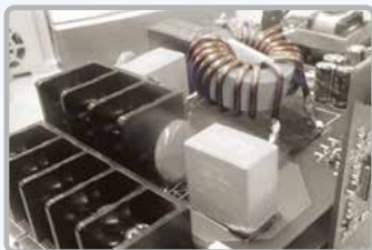
Built-in EMC Filter (C2 class)