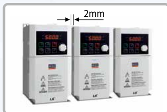
Side-by-side Installation (2mm between drives)