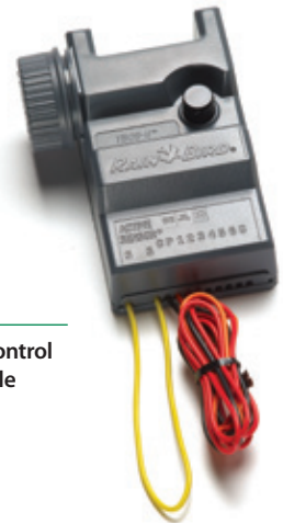
TBOS-II Control Module