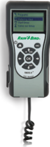
TBOS-II Field Transmitter