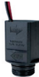
TBOS Potted Latching Solenoid