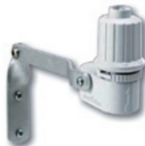
RSD-Bex Rain Shutoff Device