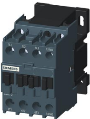
3P Power Contactor AC3:22A 1NO AC230V 50Hz Main circuit: Screw Auxiliary circuit: Screw