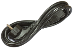
2 IEC cords