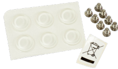
Screw and feet kit (K10)