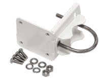
LHG precision mount