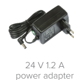
24 V 1.2 A power adapter