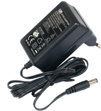
24 V 0.8 A power adapter