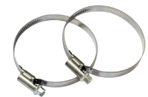
2x metal rings