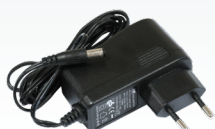
24 V 0.38 A power adapter