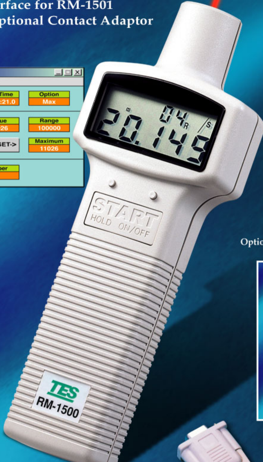
Optional Contact Adaptor RM-1502