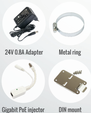
24V 0.8A Adapter