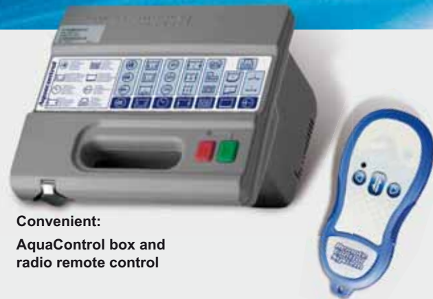
Convenient: AquaControl box and radio remote control

dinotec GmbH Water and Pool Technology Spessartstr. 7 D-63477 Maintal Phone: +49(0)6109-6011-0 Fax: +49(0)6109-6011-90 E-mail: mail@dinotec.de www.dinotec.de