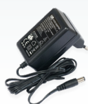
24 V 0.8 A power adapter