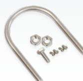
K-70 fastening set