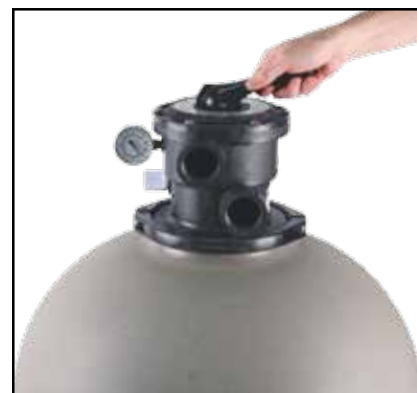
Vari-Flo™ 7-Position Control Valve with easy-to-use lever-action handle lets you "dial" any of seven valve/filter functions.