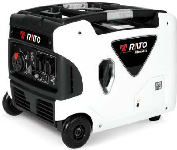
Multi-function control panel.