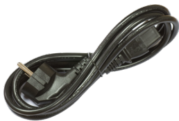
2 IEC cords