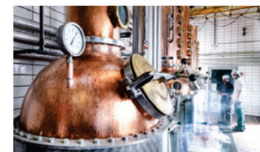
Pumps with magnetic coupling for safety in explosion-hazardous environments.